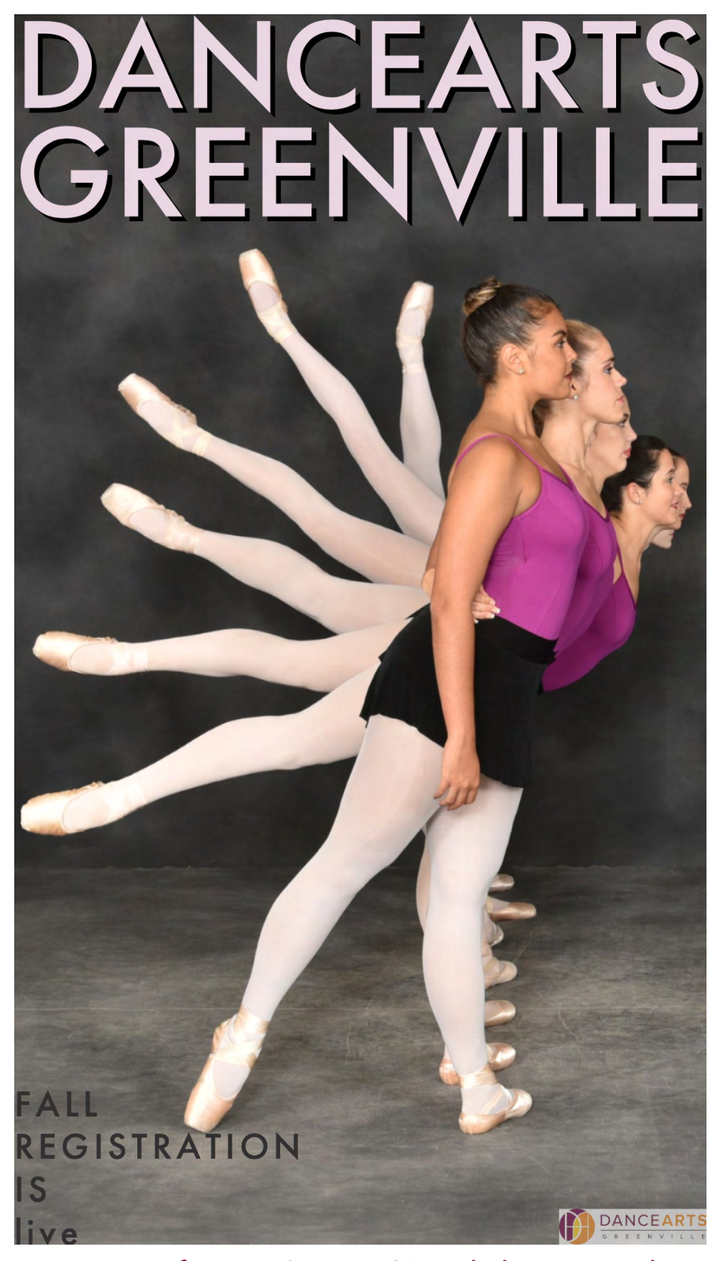
Registration for 2019/2020 is OPEN, link on our website DanceArtsGreenville.com